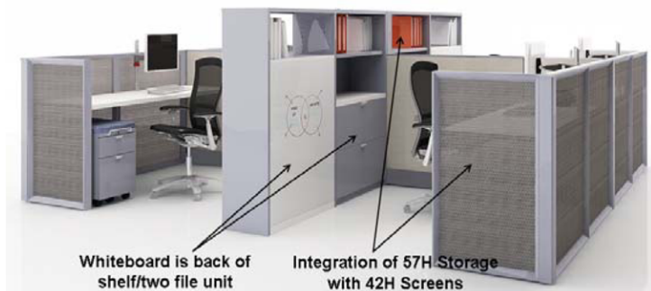
Whiteboard is back of shelf/two file unit

This has also impacted workstation design. Designers have been called upon to do more with less, create greater efficiencies in the use of real estate and reduce cost. These are CHALLENGING TIMES!