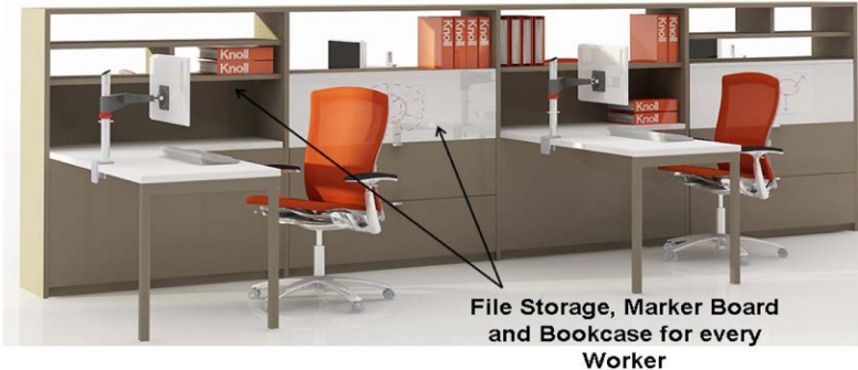
File Storage, Marker Board and Bookcase for every Worker

The prevalence of Smartphones and virtual conferencing has been the greatest influence on the changing office dynamic. Employees are no longer tied to a desk for "WORK". Staying connected is easier than ever. Employees can work from home, from their car and from the road. So employers are reevaluating the space needs of workers.